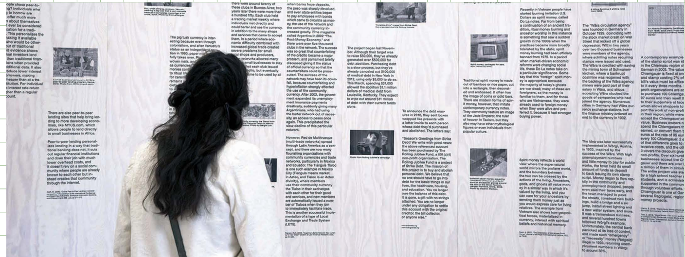
Stefanos Tsivopoulos, Alternative Economies: An Archive And A Manifesto , 2013. Installation view (detail).

At The 8th Floor, Tsivopoulos presents History Zero as a film installation that is expanded into an architecture of display, integrated with archival images, texts, and objects, representing thirty-two substitute currencies from his ongoing research project Alternative Currencies: An Archive And A Manifesto . Initially shown in 2013 at the Venice Biennale, the archive continues to take different forms, this time activated by performative engagement. Examples of alternative currencies in the archive include Cattle, Lending Libraries and Collaborative Consumption, and the Rolling Jubilee. Cattle has been a form of currency in Ancient Greece, Medieval Europe, India, Colonial Europe, and still today in