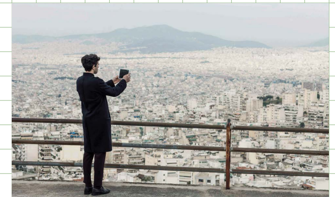
Stefanos Tsvipoulos, History Zero , 2013. Three-channel video installation, color, sound, 34 min. Video stills. Courtesy of the artist and Prometeogallery di Ida Pisani.