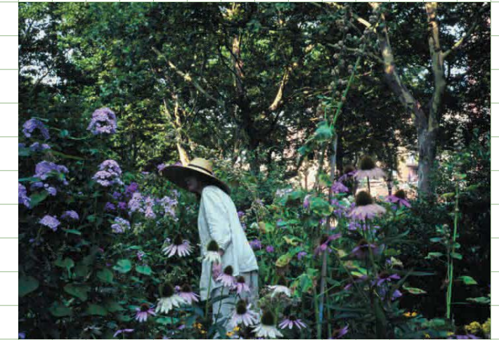
Photographs of M'Finda Kalunga Community Garden. https://www.mkgarden.org .

dismantle the hierarchies that delineate our current political and economic life. They make it possible to contemplate forgetting work, and posit gardening as a step towards reparations. Each of these possibilities require relational engagement at the community level, with a recognition and acceptance of history. In a city like New York, a radically different balance might be found in our very own backyards, taking the form of something akin to a community garden.