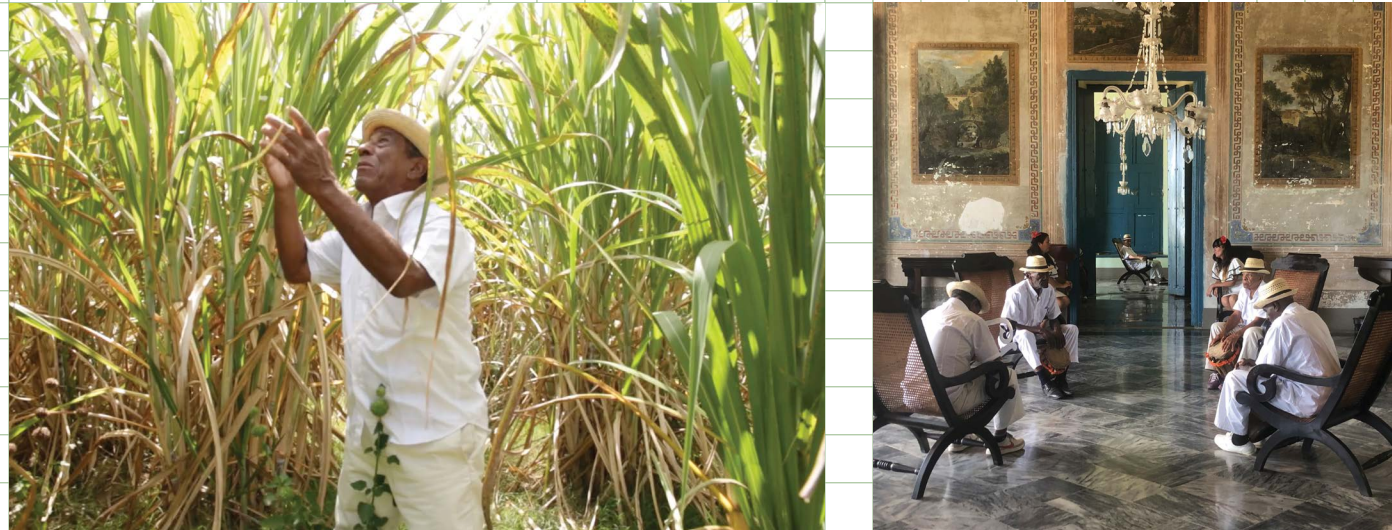
Tania Candiani, Del sonido de la labor. Cantos de trabajo/From the Sound of Labor. Work Songs , 2019. Single-channel video, color, sound. 12:58 min. Video stills.

to keep the archive open to interpretation. During the course of the exhibition, the archive will be activated by performers in order to aid viewers in accessing the depth of content, which traverses both history and geography, enabling countless readings.