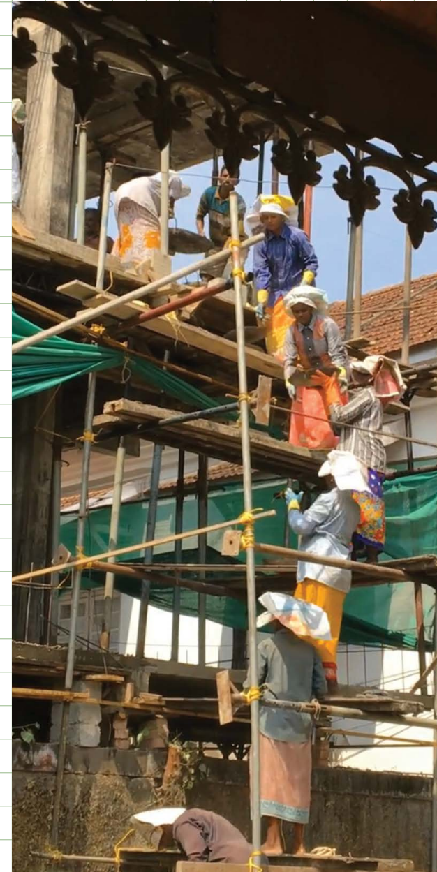
Tania Candiani, Labor Choreography I , 2017. Single-channel video, sound. 8:03 min. Video still.

Labor Choreography registers as an experimental video in which the action is readymade – unsurprising considering how commonplace construction work has become in urban centers around the globe, familiar signs of development and gentrification. As a found work of choreography, Candiani's piece reveals the individual side of collective physical labor, each woman dressed in an anti-uniform of contrasting colors and prints, with fabric headwraps blocking them from intense sunlight, as their figures, animated by gloved hands in orange, white, blue, and yellow, pass the construction material up and away. In a