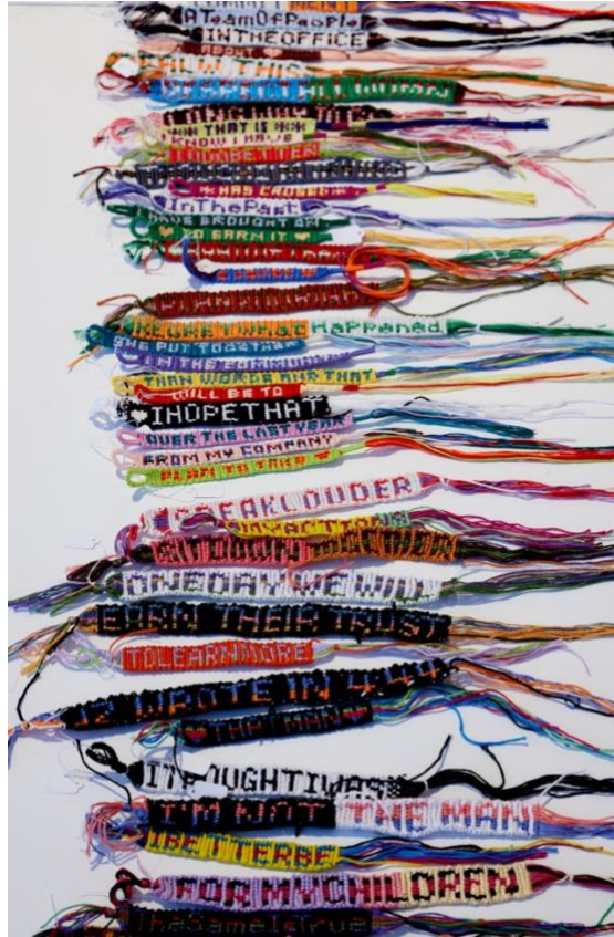
Detail of BANG GEUL HAN's Apology Bracelets (Harvey) , 2022, cotton embroidery floss, 304.8 × 50.8 × 27.9 cm, at "Land of Tenderness," The 8th Floor, New York.

Like the tapestries or jewelry displayed, the exhibition weaved together the subject matter of immigration and the female body. Simply yet cogently, it conveyed the confinement and control institutions of power place on bodies in the name of regulation or entertainment. Moreover, Han's art not only underlined some of the noxious documents of the Trump era in particular and the history of the US government in general, but it also transformed them, integrating them into mixed media meant for open communication, care, and compassion.