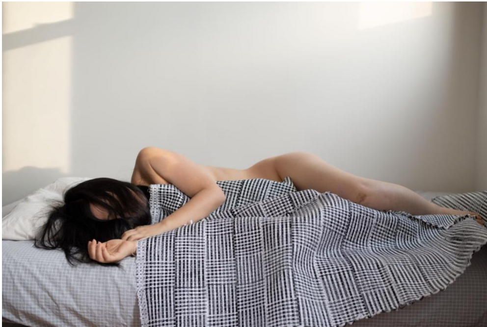
BANG GEUL HAN , Warp and Weft #03 – Sleeping , 2022, archival inkjet print, 40.6 × 27.1 cm printed on 55.9 × 43.2 cm paper.