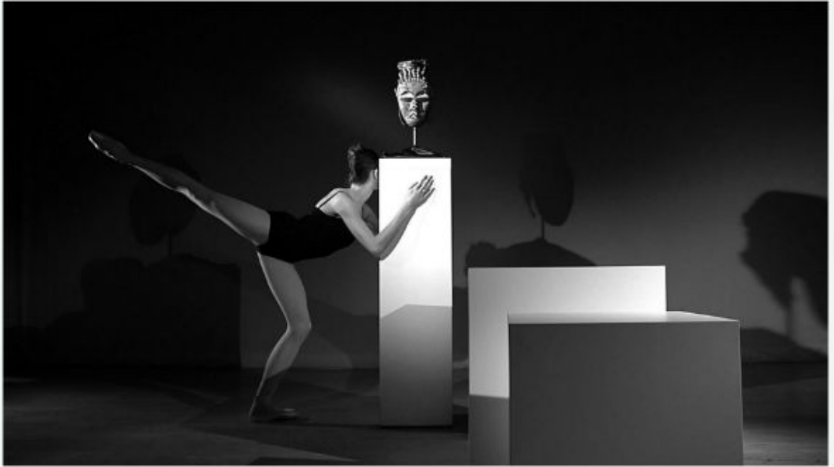
Brendan Fernandes (b. 1979, Nairobi, Kenya), As One I, 2015, 15 x 9 inches, Silver Gelatin Print, Comissioned by the Seattle Art Museum.

While many of the works make for deep and profound imagery of the human body and its role in culture and history on their own, the narrative they create when grouped together tells a story of the human body's beauty, struggle, will and perseverance throughout time.