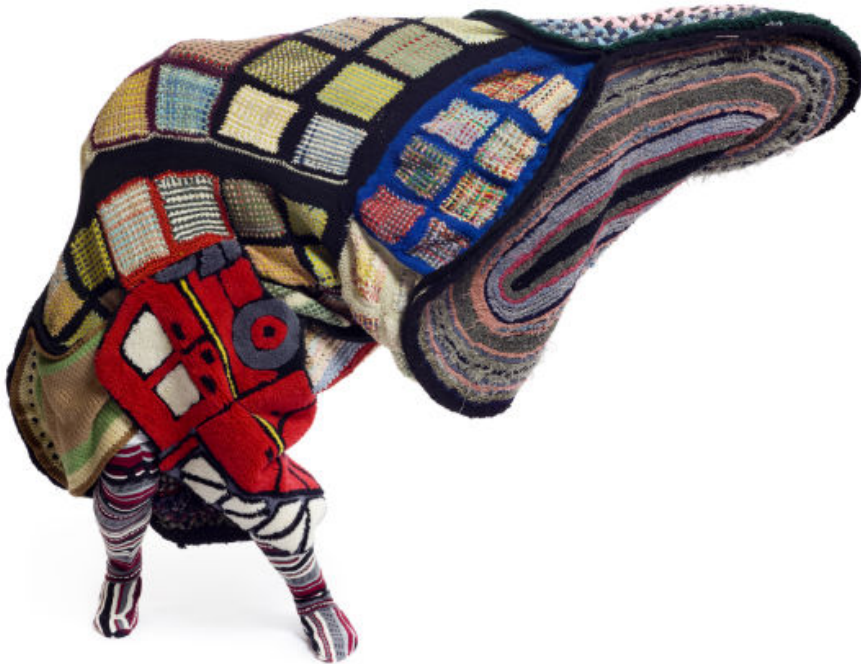
Nick Cave (b. 1959, Missouri), Soundsuit, 2011, Mixed media including rugs, afghans, metal, fabric, and mannequin, 98 1/2 x 21 1/2 x 20 inches, ©Nick Cave.