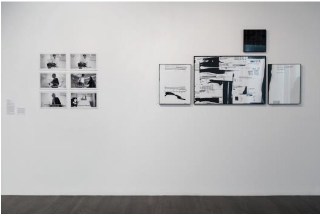
Installation view of "Enacting Stillness" (2016), at the Eighth Floor, New York

What the performance can do, however, with perhaps greater effectiveness than any abstract critique, is allow the audience to feel that critique's visceral, lived force. As an experience, therefore, "Maze" was powerful and uncomfortable in a politically productive way. Because the predominantly white audience could walk and sit around the entire 360-degree space of the platform, they not only watched Martiel become entombed in his metaphoric prison, they also watched each other watching the spectacle. In other words, the performance forced audience members, of whatever race, to confront, in an immediate, experiential way, their complicity as bystanders to the scene — and, by implication, to the atrocities of the larger U.S. prison system.