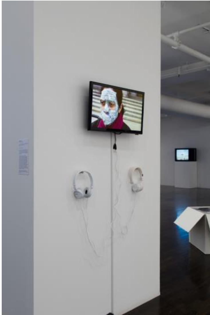
Installation view of "Enacting Stillness" (2016), at the Eighth Floor, New York

The performance works that comprise Enacting Stillness depend on similar feats of modest corporeal proffering. On one video screen ("Anthology (Maren Hassinger)," 2011), we see audience members manipulate and reposition Clifford Owens' naked and passive black body across the space of a large white rectangle on the floor. On another screen ("A Homeless Woman (Cairo)," 2001), Kimsooja lies inert on the ground in a city plaza, ringed round by a throng of curious and amused onlookers. On yet another ("An Auto-Ethnographic Study: The Bronx," 2008), Alicia