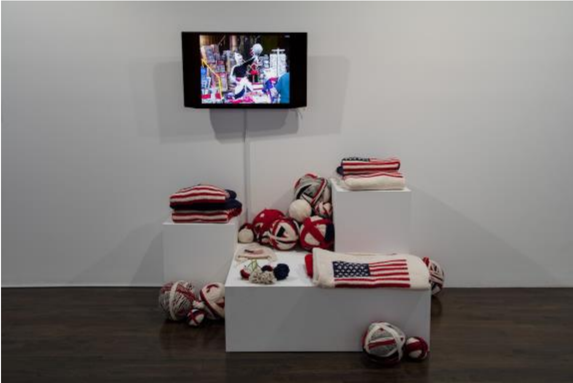
Installation view of “Enacting Stillness” (2016), at the Eighth Floor, New York

Yoko Inoue’s 2006-2016 “Transmigration of the SOLD” is similarly unassuming and concentrated. For the ongoing performance, Inoue sets up a vendor’s stall on Canal Street in New York City’s Chinatown where it appears she is in the process of making and selling knitwear containing an image of the American flag. Upon closer inspection, however, it turns out she is not knitting or selling the sweaters but unravelling them. This defamiliarizing move not only confronts the potential customer with a portion of the otherwise occluded history of the product’s materials and labor but also constitutes a gesture of artistic self-effacement that could stand as an allegory for the nature of performance art. Just as the sweaters disappear from view, leaving behind only unformed yarn as their trace, so too do live performances vanish — transmigrate — into their documentary afterlives.