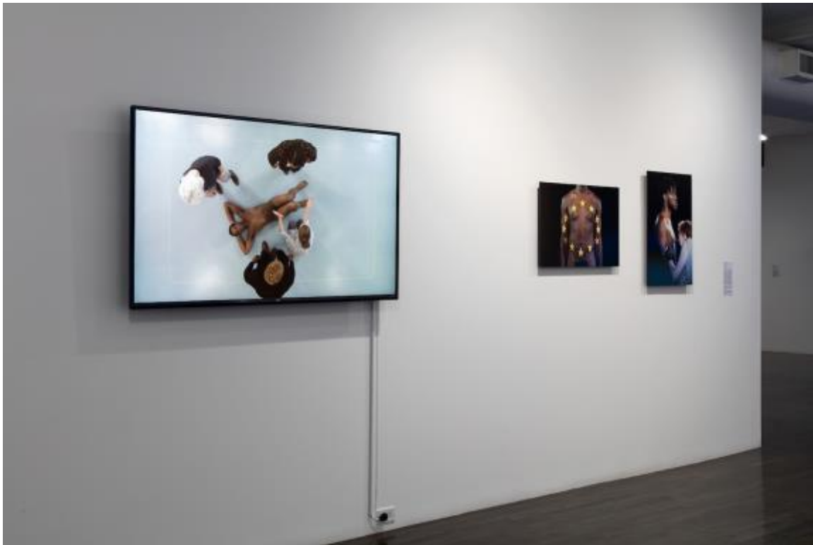
Installation view of “Enacting Stillness” (2016), at the Eighth Floor, New York