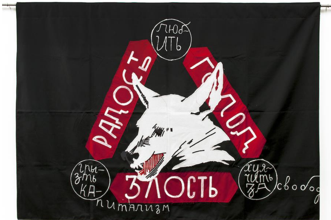
Chto Delat, “Hunger, Anger, Joy,” 2011.

Two artist collectives are featured in the show and their works highlighted my visit in many ways. Raqs Media Collective focuses on borders, liminality, and the rights to mobility between spaces. Their video installation Undoing Walls (2017) is an animation loop that abstractly explores and inverts the idea of international boundaries and borders. With it, they challenge viewers to question the very nature of border wall structures, asking , “Can a ‘dysfunctional’ wall structure be imagined so as to question the original intentions of the Federal Government? Can a ‘welcoming’ and useful wall be created, one that serves the communities that it is meant to separate and proposes an alternative solution to human segregation, when it comes to issues such as immigration and asylum?”