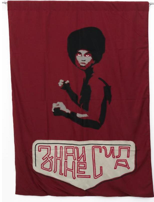
Chto Delat, "Knowledge Is Power," 2011.

Here in my favorite room of the show, glass displays and hung ephemera chronicle Scott's and Bruguera's work along with newspaper, media, and popular reactions from the public. As the press release states , "[e]ach known for touchstone works pointing to the limits of free speech and freedom of expression, Tania Bruguera and Dread Scott present works that serve as prompts for participation. Their contributions to the exhibition elaborate on the legacy of artworks like Scott's What is the Proper Way to Display a U.S. Flag (1988), and Bruguera's Tatlin's Whisper (2009), amplifying individual agency and collective efforts in making political change happen."